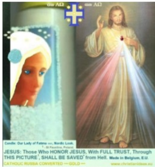
Candle: Our Lady of Fatima ☩, Nordic Look. 1 - St Faustina, Poland JESUS: Those Who HONOR JESUS, With FULL TRUST, Through THIS PICTURE, SHALL BE SAVED from Hell. Made in Belgium, E.U. CATHOLIC RUSSIA CONVERTED ☩ GOLD ☩ www.christianideas.eu Fr Gaucher: Notre-Dame de Fátima, look Nordique. Droite: SALUT' ETERNEL. AUTOMATIQUE, SI VOUS HONOREZ JÉSUS, DE PLEINE CONFIANCE, par cet image. Esp Izq: Nuestra Señora de Fátima, look Nórdico. Derecha: SALVACIÓN ETERNA AUTOMÁTICA, SI HONRAS a JESUS, de PLENA CONFIANZA, POR ESTA IMAGEN. NL Links: OLV van Fátima, Nordische look. Rechts: AUTOMATISCHE EEUWIGE REDDING, als U JEZUS EERT, met VOLLE VERTROUWEN, DOOR DIT BEELD. D Links: Unsere Liebe Frau von Fatima, Nordischer look. Rechts: AUTOMATISCHE EWIGES HEIL, WENN SIE JESUS VOLL VERTRAUEN, DURCH DIESES BILD. P Esc: Nossa Senhora de Fátima, look Visigótico. Dereita: SALVAÇÃO ETERNA AUTOMÁTICA, SE HONRAR JESUS, de PLENA CONFIANÇA, por esta imagem.