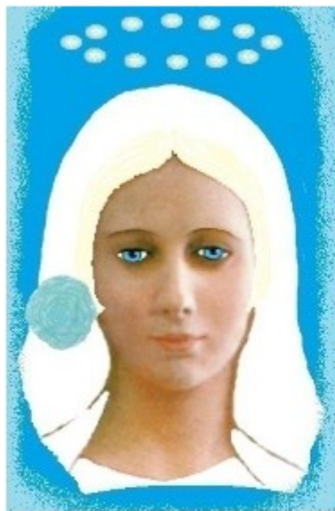
Our Lady of Fatima 1917 was very Beautiful Nossa Senhora de Fátima era muito bela

private void philosopherThinks(int time, int iterations) { int thinks; thinks= (int)(minThinkTime+Math.random()*time); System.out.print ("\n Phil_id:" + getPhilosopherId() +" begins thinking "+ thinks+ " ms. NrPhilsEating:"+getNrPhilosophersEating()+". Eats?:"+this.isEating()+ ". Meals: *"+getNrMeals() +"*. Count: "+ iterations+"."); try {Thread.sleep(thinks);} catch(InterruptedException e) {}; }