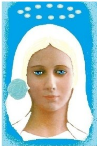
Our Lady of Fatima 1917 was very Beautiful Nossa Senhora de Fátima era muito bela She asked us to pray the Rosary everyday. She asked also the correct consecration of Russia to her Immaculate heart. Otherwise, Russia would spread its errors all over the world: communisms / socialisms, orthodoxy, wars... , said God also .